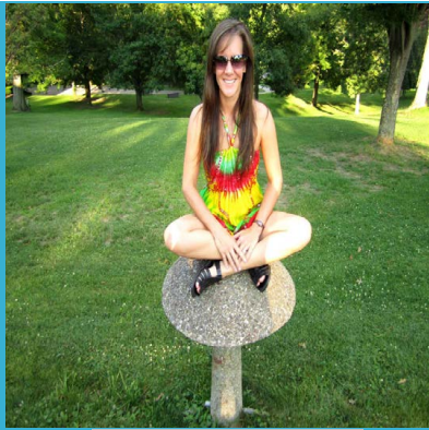
President of MOESES

education expenditures only. Contribution information to MOESES will not be released to the public.